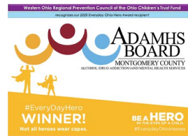
Montgomery County ADAMHS Board

Montgomery County Alcohol, Drug Addiction, & Mental Health Services Board (ADAMHS) has been selected as the Western Ohio Region's award winner.